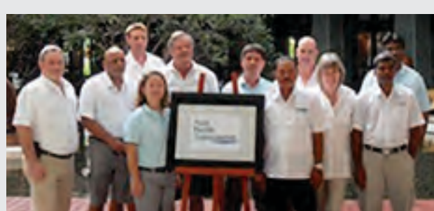
APS team leaders of agent network in Asia