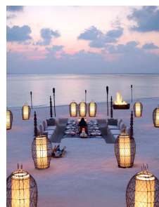
Sand Spit Picnic – Dusit Island

A beautiful sanctuary sheltered by nature amidst white sandy beaches and encircled by a turquoise lagoon, 100 top of the line