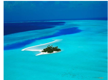
Aerial shot of Sunrise Island

These Maldives archipelago miniscule coral islets of deep blue seas offer fantastic cruising adventures with the waterways providing the best and most natural of transport and overhead weather generally picture perfect - sunlit days, breezy nights, balmy mornings and iridescent sunsets.