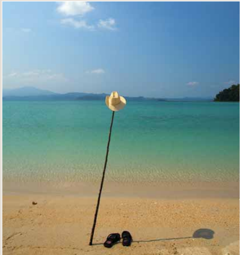
ROSS & SMITH ISLAND AT DIGLIPUR, ANDAMAN

The threat of piracy is often discussed as a concern in the region. Where such incidents have occurred, hijackings have tended to be of tankers for oil cargoes in certain localised commercial trading hubs, or of more notoriety when travelling en-route to Asia along the east coast of Africa. Caution and good judgment should therefore be exercised and, crucially, insurance coverage should be in place to cover such risks. ■