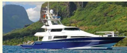
MY Ultimate Lady à Moorea in French Polynesia