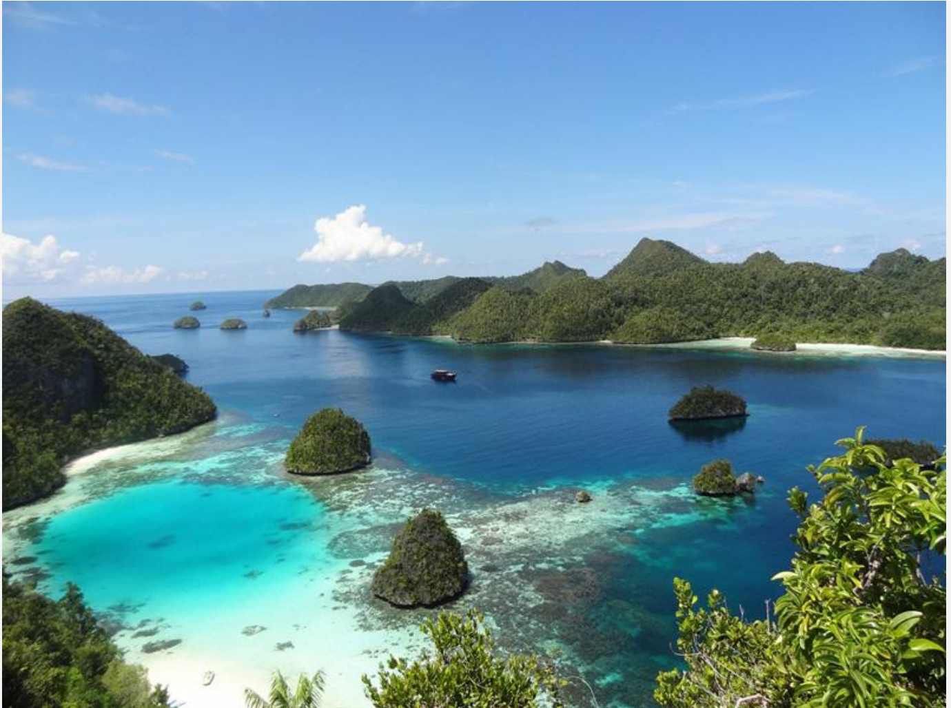
Indonesia archipelago

After another blockbuster season along the 8th Parallel (Bali to Komodo mainly), Asia Pacific Superyachts Indonesia is gearing up for the second act: Raja Ampat season!