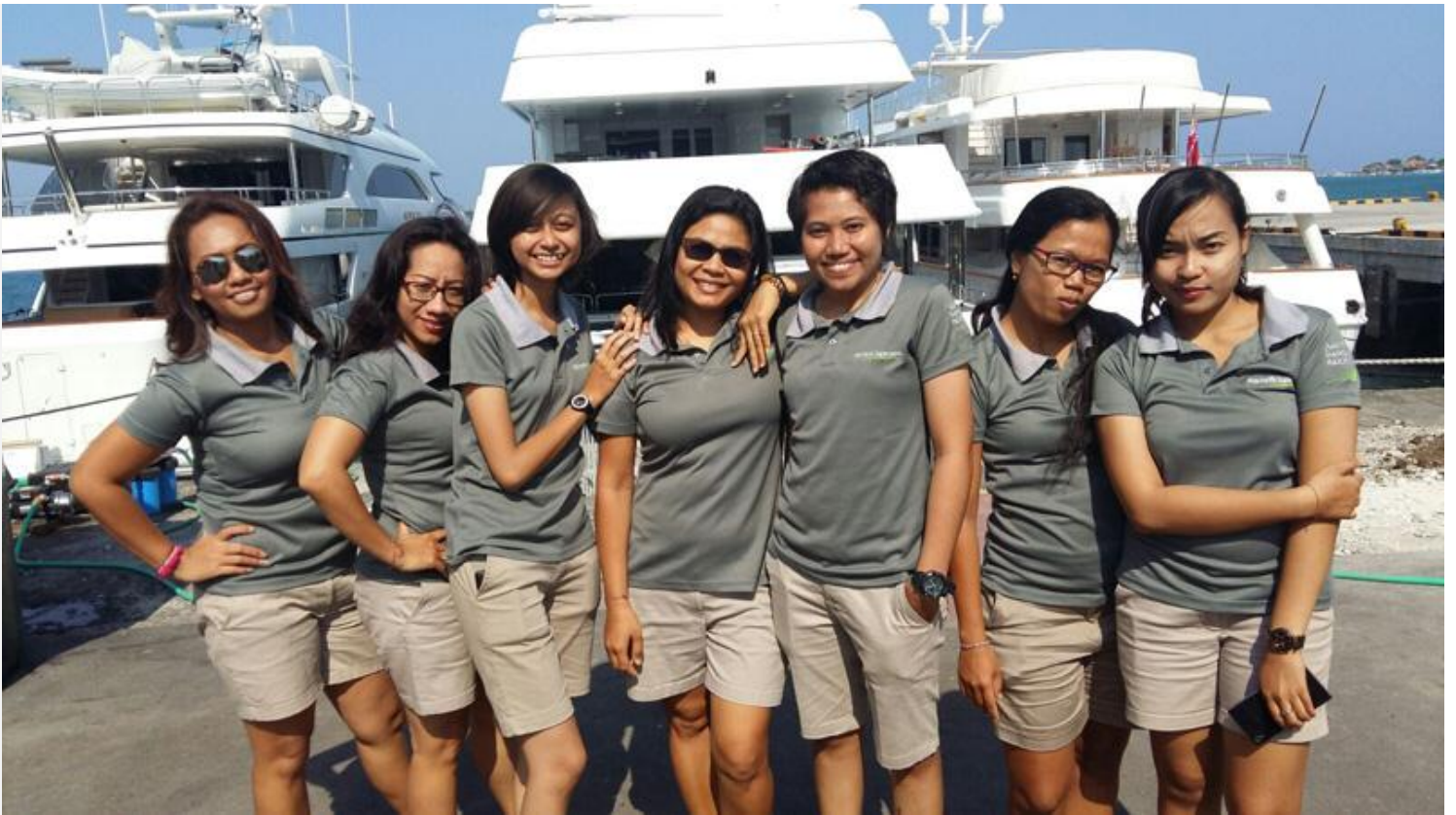
Asia Pacific Superyacht Indonesia – the Bali team.