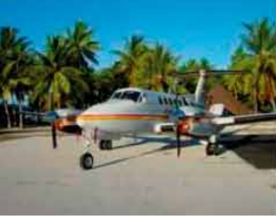
PRIVATE JET CHARTERS