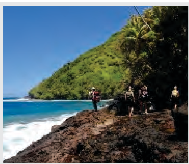
Tahiti Iti - Te Pari Coast

I have been a yacht agent in Tahiti for almost 20 years and have worked with many captains to open new itineraries to some remote and seldom cruised places in French Polynesia. For the exploring mind there are other wondrous areas to visit besides Bora Bora; specifically, five places around French Polynesia which are not commonly known. In my view, the following are very much worth a visit.