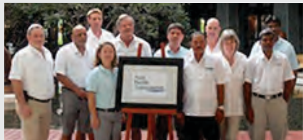
APS team leaders of agent network in Asia