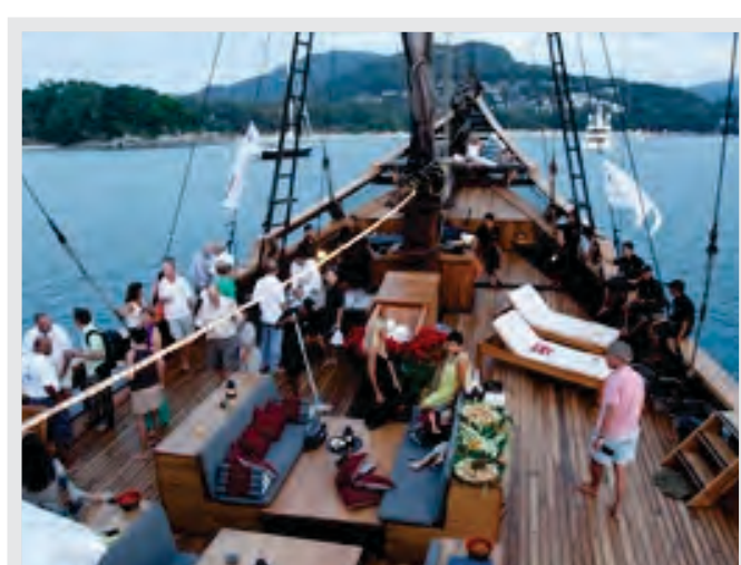
Asia Superyacht Rendezvous will once again welcome guests aboard party host S/Y Silolona in Phuket, Thailand

PHUKET: Asia Superyacht Rendezvous 2014 organizers have confirmed the event's opening cocktail party will be hosted aboard a luxury superyacht. "As the Asia Superyacht Rendezvous party preparations for another spectacular event Dec. 16-18, we are happy to announce that the opening night cocktail party will be held aboard the stunning superyacht SY Silolona," said organisers.