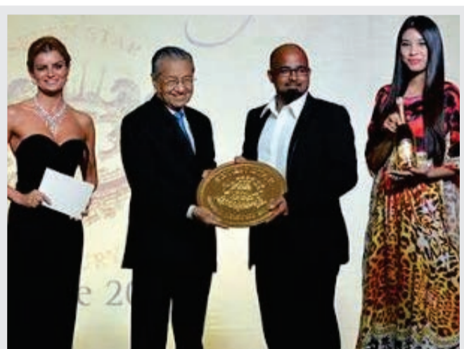
Maldives Tourism Minister Ahmed Adeb accepts award

The Maldives has won two prizes at this year's Seven Star Global Luxury Awards, winning 'Best Destination' as well as a 'Special Achievement' honour for Tourism Minister Ahmed Adeb.