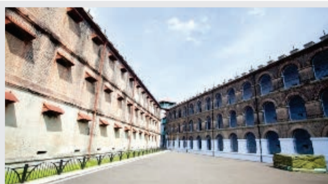
Circular Jail at Port Blair

The 'Cellular Jail' is the first sight that greets a visitor on arrival when entering Port Blair. It was known to house many notable Indian activists in the struggle for India's independence during the colonial rule in India. Finally completed in 1906, the history of using the Andaman island as a prison dates back to the Indian rebellion of 1857 when Indian freedom fighters were sent to the prison in the remote archipelago, used by the British especially to exile political prisoners.