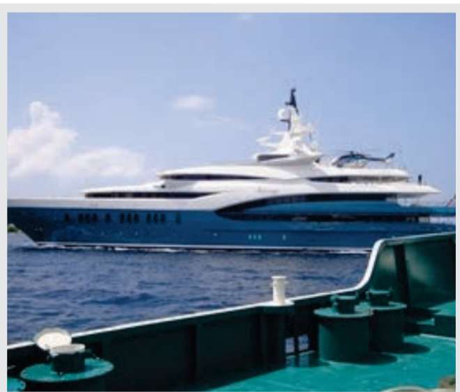
Superyacht M/Y Sunrays with bunker barge while in the Maldives

Earlier this year Mohamed Hameed of Asia Pacific Superyachts Maldives made the following announcement now benefitting visiting yachts to the Maldives. "After two years of convincing work by our team we finally can share the rule change for tourist vessels." The changing of the past rule - which before provided for a 90 day stay of a tourist vessel allowed in the Maldives - now officially changed to the new rule providing for a 180 day; or if the boat is registered in IMO, the stay can be extended up to 270 days in total for the vessel.