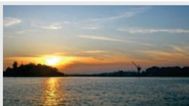
Arrival at Port Blair

Those interested in cruising the clear waters of the Andaman Seas will find enchanting islands with miles of seclusion offering drift diving over coral gardens, good sailing winds and pure blue waters with a temperature of 28°. Skippers can fly or sail down from either Phuket, cruising the 400 NM to Port Blair in the Bay of Bengal; or from Langkawi, Malaysia to the entry port at 11°40.3'North x 92°44.2' East.