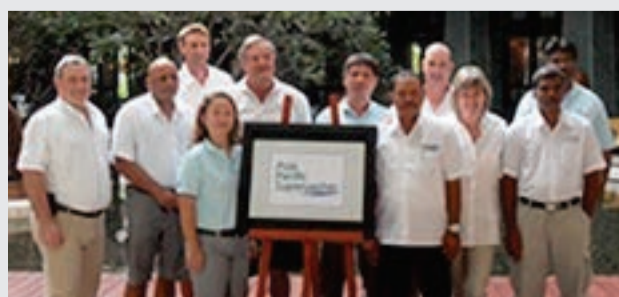
APS team leaders of agent network in Asia