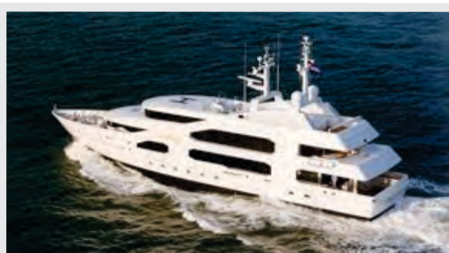
Superyacht M/Y Double Haven

Those interested in cruising the clear waters of the Andaman Seas will find enchanting islands with miles of seclusion offering drift diving over coral gardens, good sailing winds and pure blue waters with a temperature of 28°. Skippers can fly or sail down from either Phuket, cruising the 400 NM to Port Blair in the Bay of Bengal; or from Langkawi, Malaysia to the entry port at 11°40.3'North x 92°44.2' East.