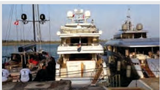
Visiting Superyachts fill Benoa Harbour's South dock in Bali

"Due to the amount of boats this season, APS Indonesia has had to have a stern platform installed at the South dock of Benoa Harbour which allows us to have 3 yachts Mediterranean tied in this area. The boats are serviced with fuel and water on demand and we hope to be able to supply shore power at some point in the near future", reports Richard Lofthouse of Asia Pacific Superyachts Indonesia.'