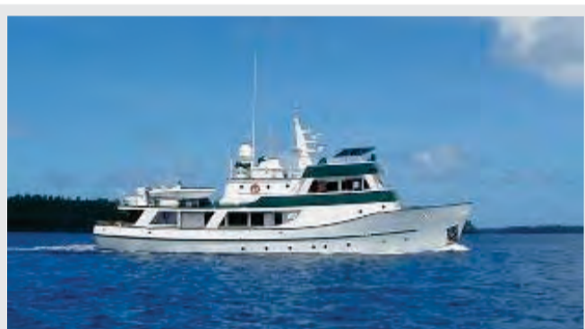
M/y Askari cruising in Tahiti

Etienne Boutin of APS Tahiti shares the following tax changes: "I would like to report that Tahiti charter tax has just dropped to 5% of gross revenues (previous rate was 12%). We hope this change will help more guests decide on our islands as their next charter destination and enjoy the French Polynesia preserved marine environment and fun land based activities