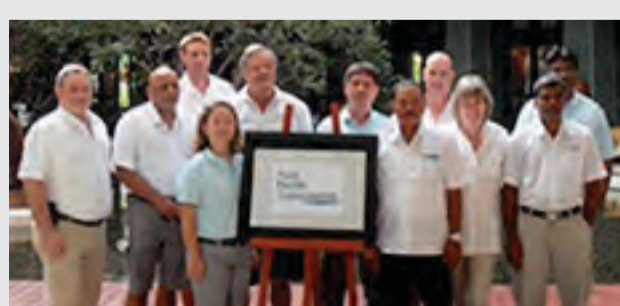
APS team leaders of agent network in Asia