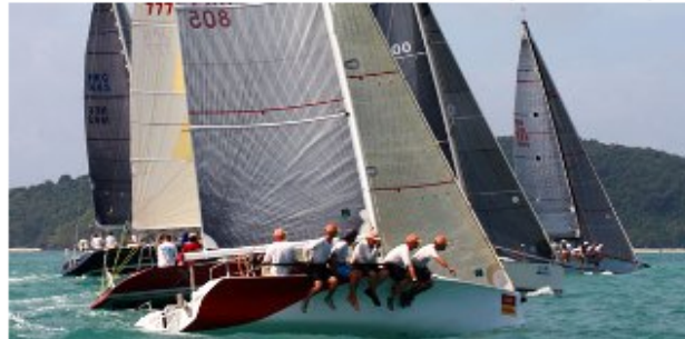
Cape Panwa Hotel Phuket Raceweek 2015

International sailors will be flocking to Cape Panwa Hotel Phuket Raceweek. The region's exciting regatta returns to Cape Panwa and the Thai island of Phuket is preparing for an influx of visitors in July as more than 500 sailors and spectators from around the world head to the island to compete in the prestigious Cape Panwa Hotel Phuket Raceweek 2015 to take place the 15-19 July off Phuket's southeast coast.