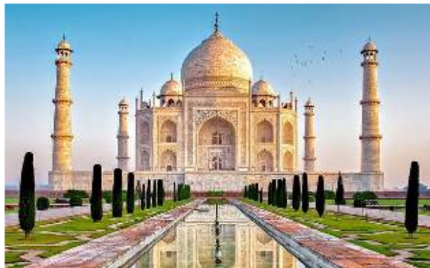
India's extraordinary attractions

Ministry of Civil Aviation, Govt. of India has permitted foreign charter flights to land at Port Blair subject to the fulfillment of the guidelines issued by Director General, Civil Aviation, Govt. of India. Andaman Islands are a world class eco-tourism destination.